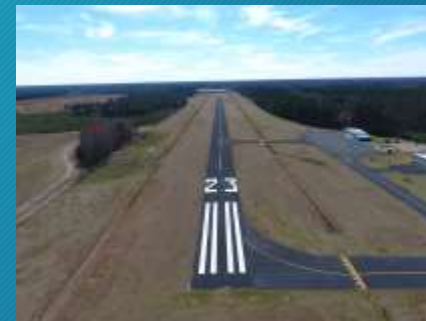
Before and After Sealing